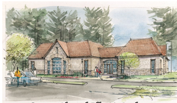
George H. and Ella M. Rodgers Memorial Library

18 Library Street, Hudson, New Hampshire (603) 886-6030 http://www.hillsml.lib.nh.us