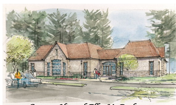
George H. and Ella M. Rodgers Memorial Library

18 Library Street, Hudson, New Hampshire (603) 886-6030 http://www.hillsml.lib.nh.us