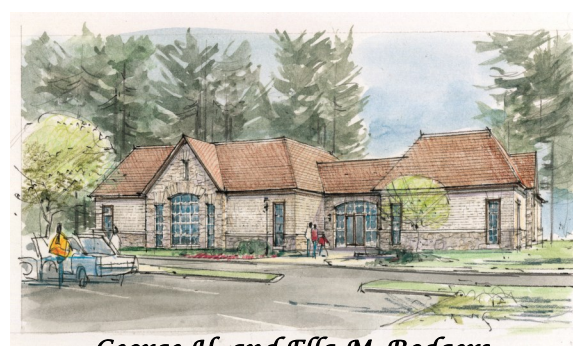
George H. and Ella M. Rodgers Memorial Library

18 Library Street, Hudson, New Hampshire (603) 886-6030 http://www.hillsmemlib.nh.us